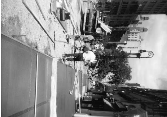
July 1998 Men at work laying new sidewalks and granite curbs on W. 72 St. See p.2.