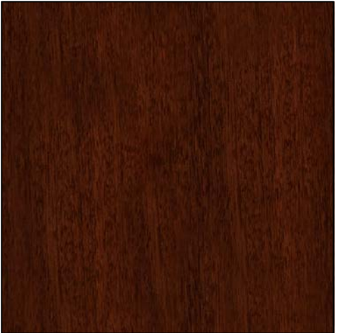
PAINTED WOOD FOR SIGN