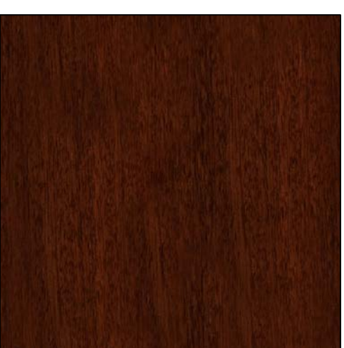
PAINTED WOOD FOR STOREFRONT