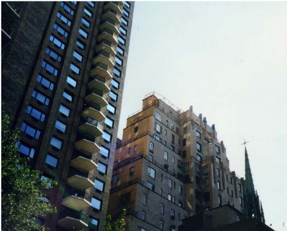
1 VIEW A FROM 65TH STREET EXISTING CONDITION WITH MOCK UP