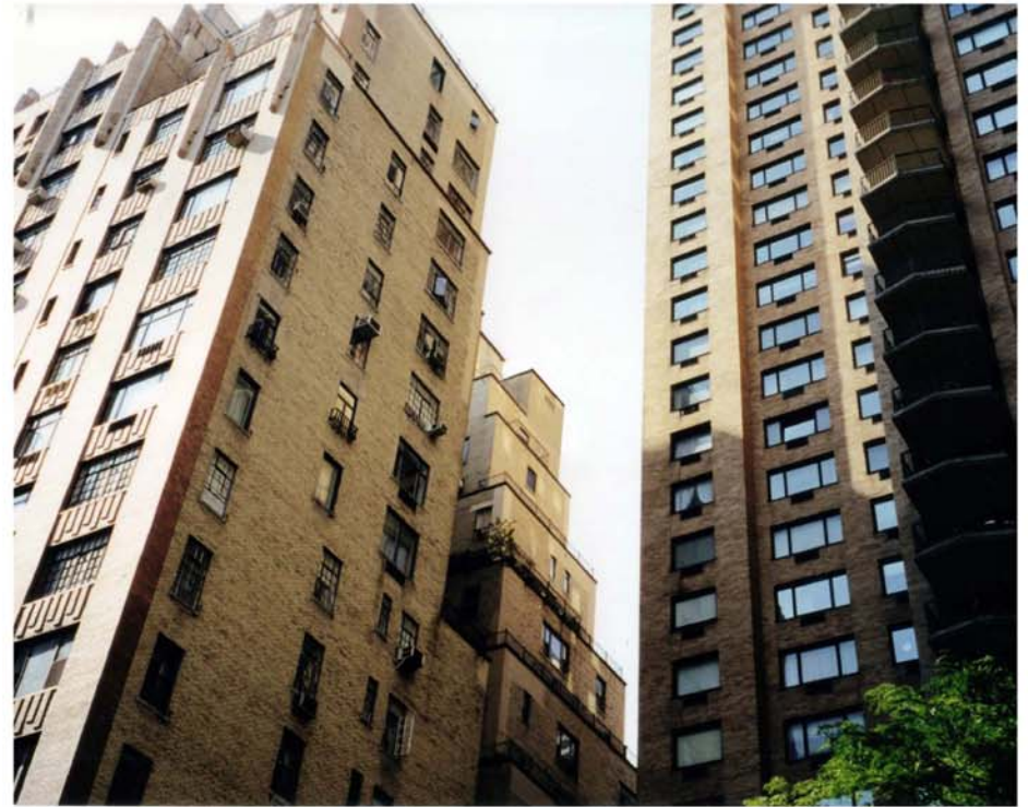
VIEW B FROM 66TH STREET EXISTING CONDITION WITH MOCK UP