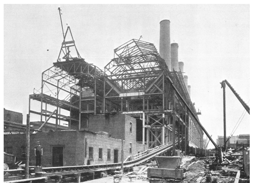
IRT Powerhouse nearing completion, c. 1904 Interborough Rapid Transit, The New York Subway: Its Construction and Equipment (New York: IRT Company, 1904), 79