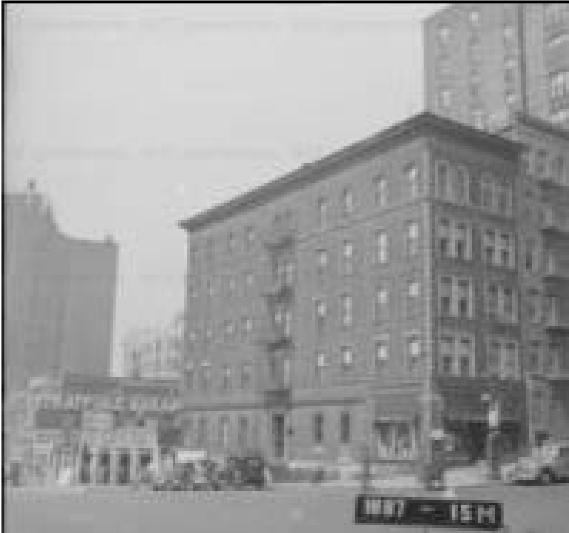
1940s Tax Photo