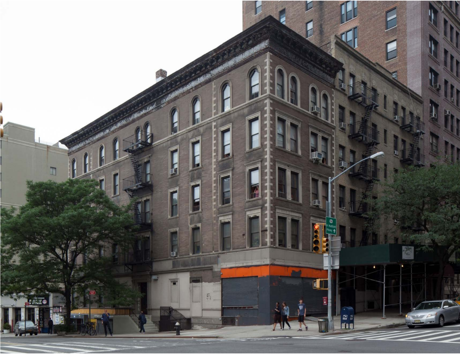
Designation Photo - 2011