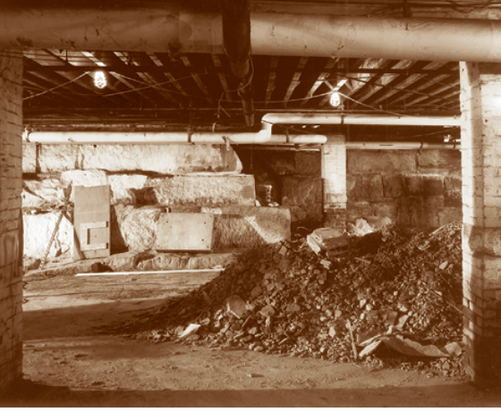
Before/after photos of the undercroft space at Trinity Church, Boston, a National Historic Landmark designed by H. H. Richardson. The renovation created program space in the underutilized basement, increasing functionality without having to build a new addition.