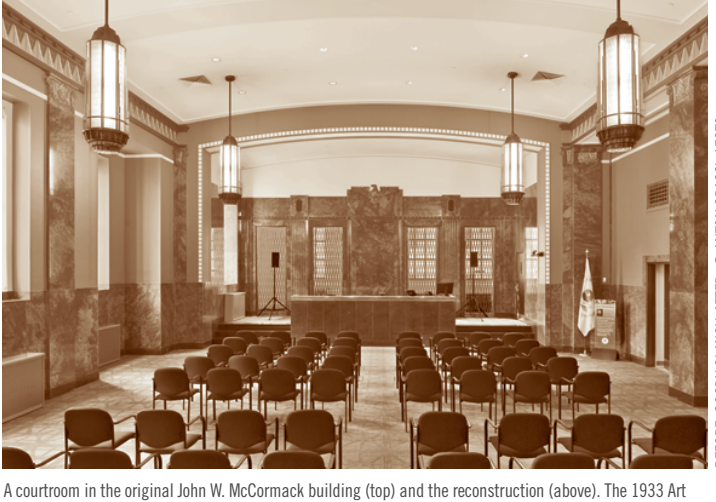
Deco federal building, designed by Cram & Ferguson, was the site of many historic judicial decisions on New Deal legislation. In 1972 it was renamed for the former Speaker of the House from Boston. The project won Silver honors In Building Design+Construction's 2011 Reconstruction Awards

10 "LEED Certification: Where Energy Efficiency Collides with Human Health," Environment and Human Health, Inc., p. 8, at: http://www.ehhi.org/leed/.