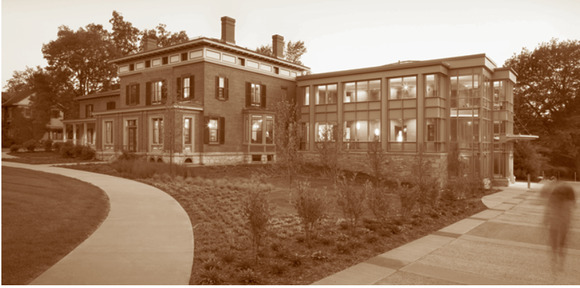
The Welcome & Admissions Center at Roger H. Perry Hall at Champlain College, Burlington, Vt., was certified LEED Platinum in 2011. The renovation and addition to the 150-year-old building restored the historic windows and added interior storm windows to achieve an overall value of R-20 with an air infiltration 60% better than code.

On the other hand, critics of historic preservation contend that preservation standards focus too narrowly on visual integrity, freezing buildings into tidy idealized images of the past and undervaluing the urgency of energy- and water-use reduction. Windows are lightning rods for strong opinions about how historic buildings