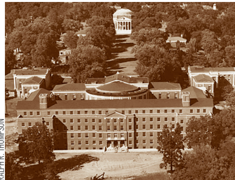
The University of Virginia chose to renovate rather than replace New Cabell Hall in part due to the significant environmental impact of new construction. PVs were ruled out as not being cost-effective.