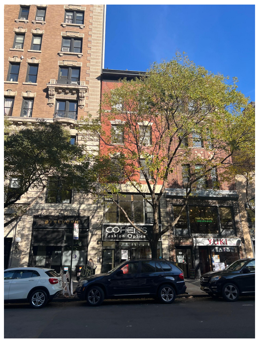
Current 72nd Street facade

Application to legalize street facing windows.